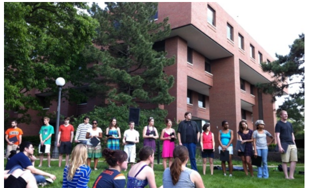
Some of our graduating students during Quad Grace (worship service on the main quad).