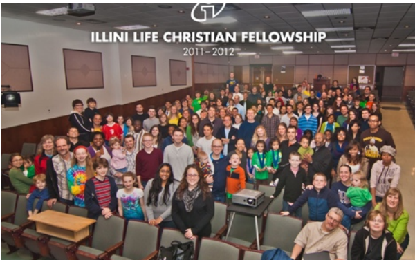
This year's Ilini Life congregation

The last few months have been full. Rather than read a lengthy reflection on them, enjoy some snapshots of the key moments.