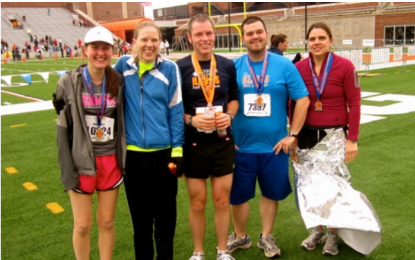
Some of the folks we ran the Illinois Marathon and 1/2 marathon with on April 28th (students and co-laborers).