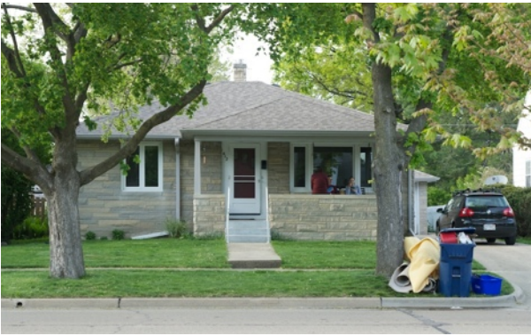
Our new home! We now live less than 1/2 a mile from the dorms we work most regularly in.