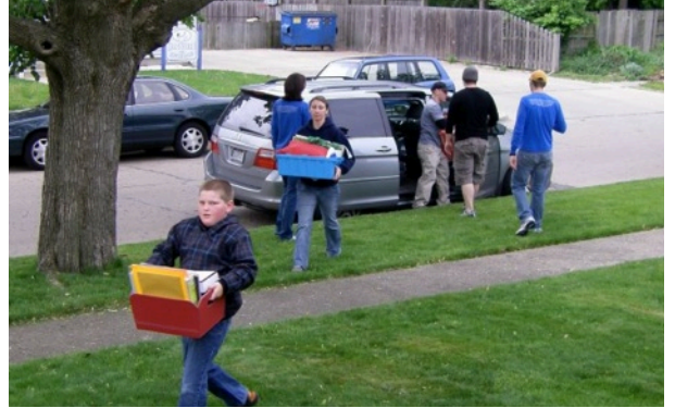
Moving day! With several of our awesome church community that helped us move.

The last few months have been full. Rather than read a lengthy reflection on them, enjoy some snapshots of the key moments.