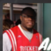
Andre Britten @andrebritten87

The roof. The roof. The roof is on #ilifememphis