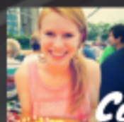
Courtney Cimo @courtneycimo

Cassie and Jake stripping shingles like mad men and women